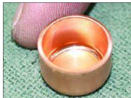
This is where a Berger VLD starts, with a very consistent jacket. This cup has just been punched from a strip of metal.

A few months ago, I was invited to go on a trip to New Zealand to test a bullet that behaves very differently than any hunting bullet on the market today, the Berger VLD. The initials stand for