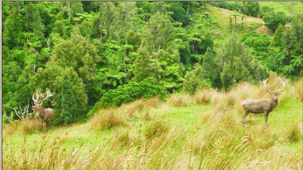
Wildlife was abundant at Wanganui Safaris, including many large red stags.

Their energy is indeed expended inside the deer – but not in the way many hunters think, as a sort of hard blow that "shocks" the deer. Instead, the energy is used to tear apart the front half of the bullet, and this violent fragmentation tears up lots of tissue inside the deer's chest. Consequently the deer usually drops quickly, on average far more often than when shot with a bullet that loses little weight and zips out the other side.